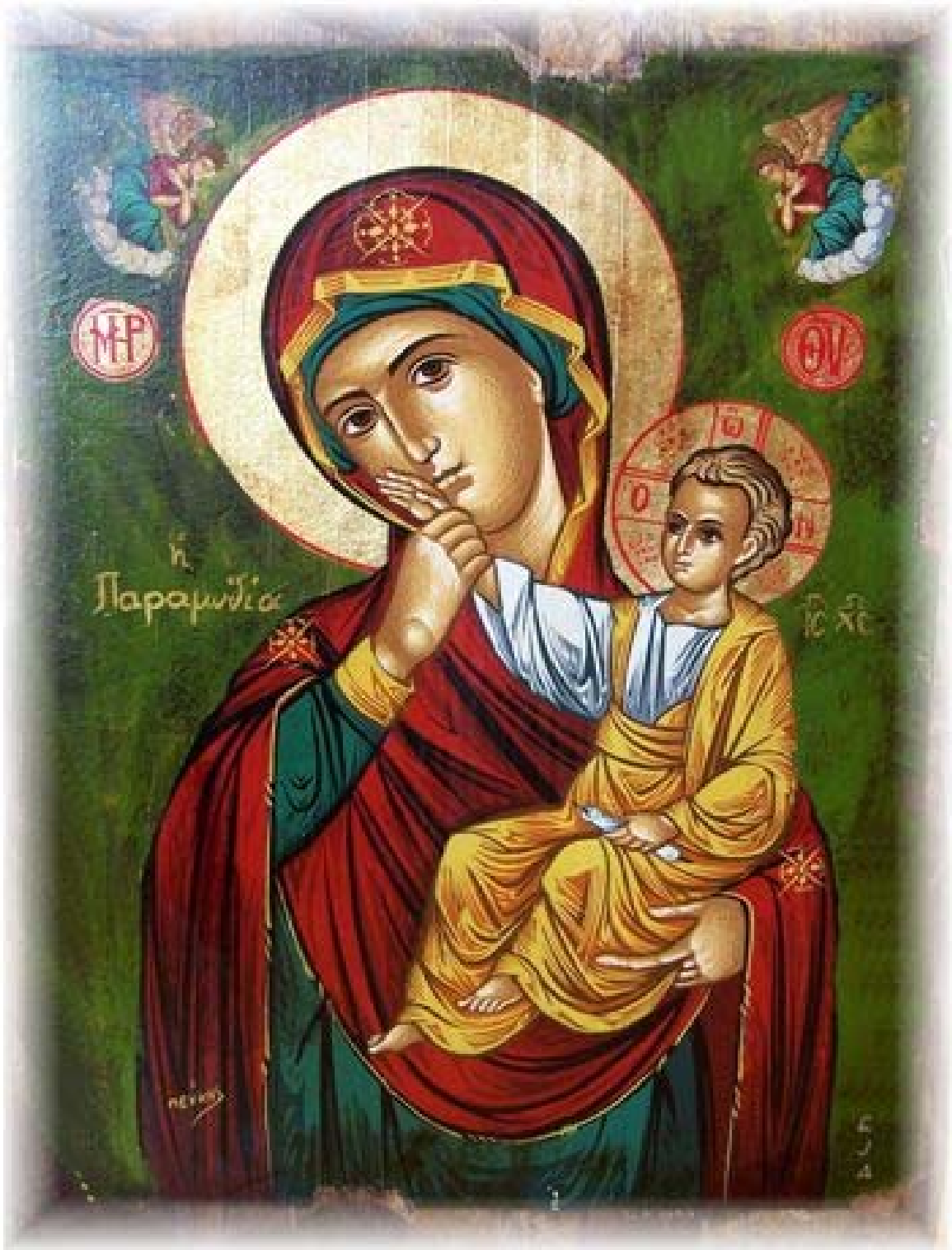
Solemnity of Mary, The Holy Mother of God January 1, 2012