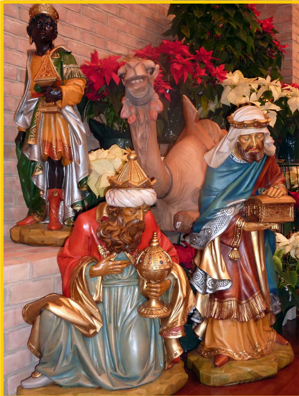
Epiphany of the Lord January 8, 2012